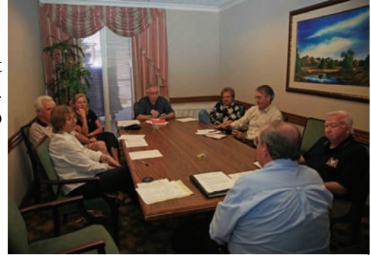
CarboLoad Committee at work

Raffle tickets: $5 each or three for $10.